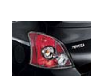
Rear Tail Light Lens (LB) $325.00 Installed MSRP*