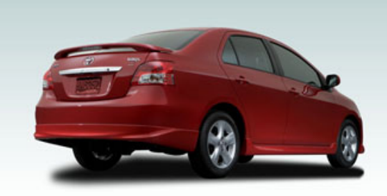
Yaris S Sedan shown in Barcelona Red Metallic with available 15-in. aluminum alloy wheels and rear spoiler