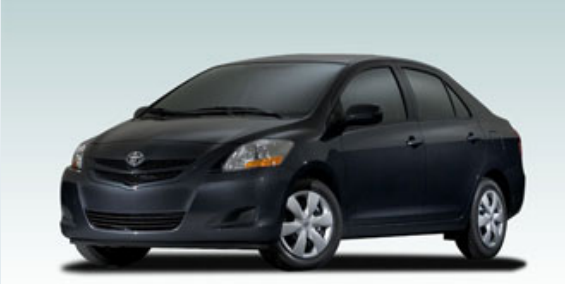
Yaris Sedan shown in Flint Mica with available 15-in. steel wheels with full wheel covers