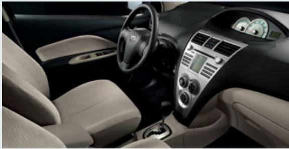
Yaris Sedan interior shown in Bisque with available Power Package and accessory floor mats