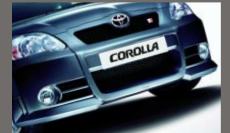
Optional front spoiler.