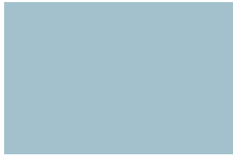
Arctic Blue Silver Metallic