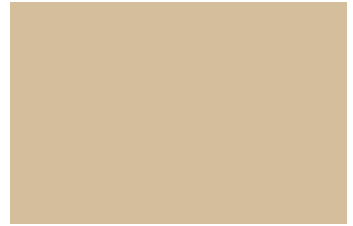
Wheat Beige Metallic