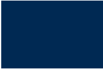
Shadow Blue Metallic