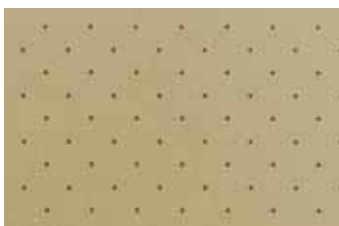
Pure Beige Leather (black carpet)#