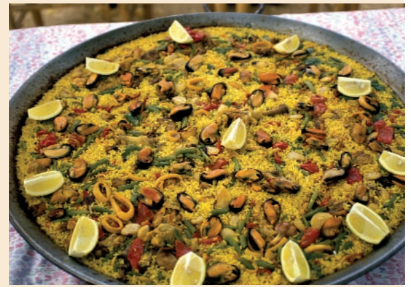
Experience all the flavors of Spain