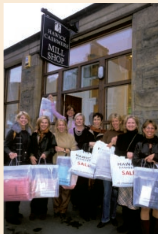
Successful shopping mission at the Cashmere Mill

Accommodations are gracious with fine cuisine. You stay in either a lovely private manor house or castle with great style and charm, or at an elegant country house hotel such as the Roxburghe. The gateway to the Borders is Edinburgh.