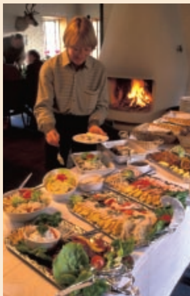
Great Danish smorgasbords

Come discover why well over 1,000 guests, shooters and nonshooters alike, have enjoyed memorable days in the field for both driven pheasants and ducks. Only the very finest estates are utilized exclusively by Frontiers. We believe Denmark offers the ideal balance between spectacular numbers and the sporting quality of the game birds that are presented to the guns.