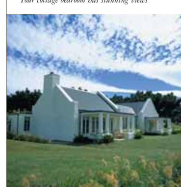
Your private cottage