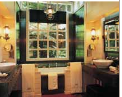
Huka Lodge, Lodge Room bathroo