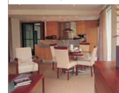
Hyatt Residence Auckland

Experience all the land down under has to offer on this exciting visit to Australia and New Zealand. See the sights of cosmopolitan Sydney. Enjoy paradise on the Great Barrier Reef. In Cairns, gateway to the Great Barrier Reef, stay at the Sofitel Reef Casino and enjoy tropical luxury in the heart of Cairns. Travel to the rugged outback and see magnificent Ayers Rock. Admire the stunning beauty of New Zealand's countryside and stay in luxurious lodge estates. This "Ultimate Australia & New Zealand" vacation includes accommodations in some of Australia's most hospitable and luxurious hotels, resorts and lodges. The charming nature of these elegant accommodations rivals that of the beautiful landscapes in which they are set.