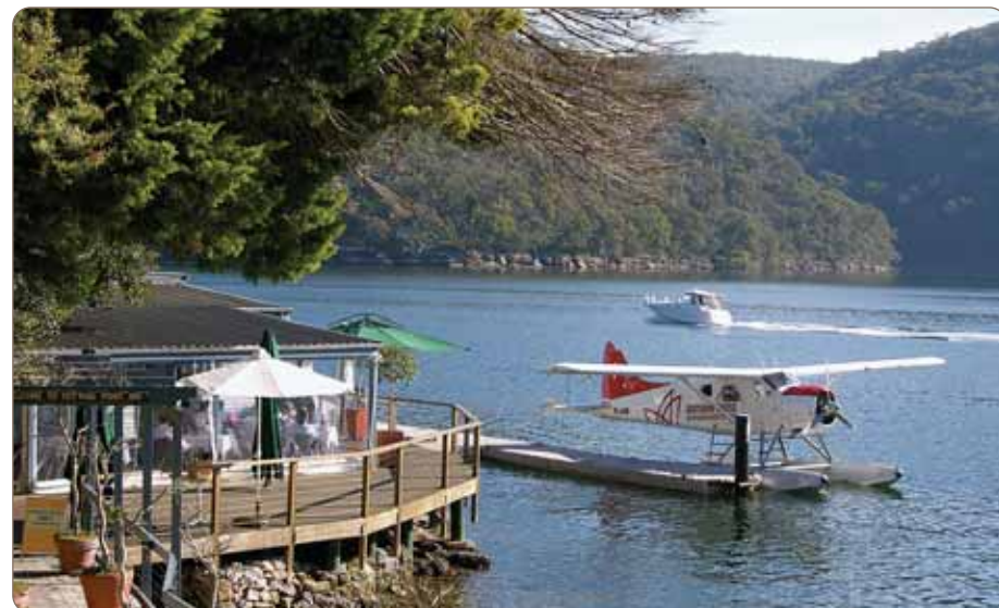
An awesome Seaplane flight to the Cottage Point Inn for lunch