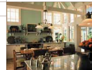
Wharekauhau Country Estate