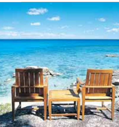
Lizard Island R & R

Nights at Destination: Sydney (3), Alice Springs (1), Kings Canyon (1), Ayers Rock (2), Cairns (1), Lizard Island (3), Auckland (1), Huka Lodge (2), Wharekauhau Country Estate (2)