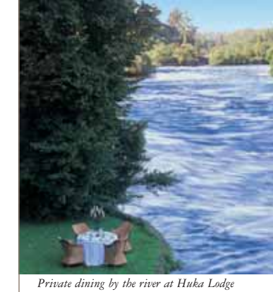
Private dining by the river at Huka Lodge